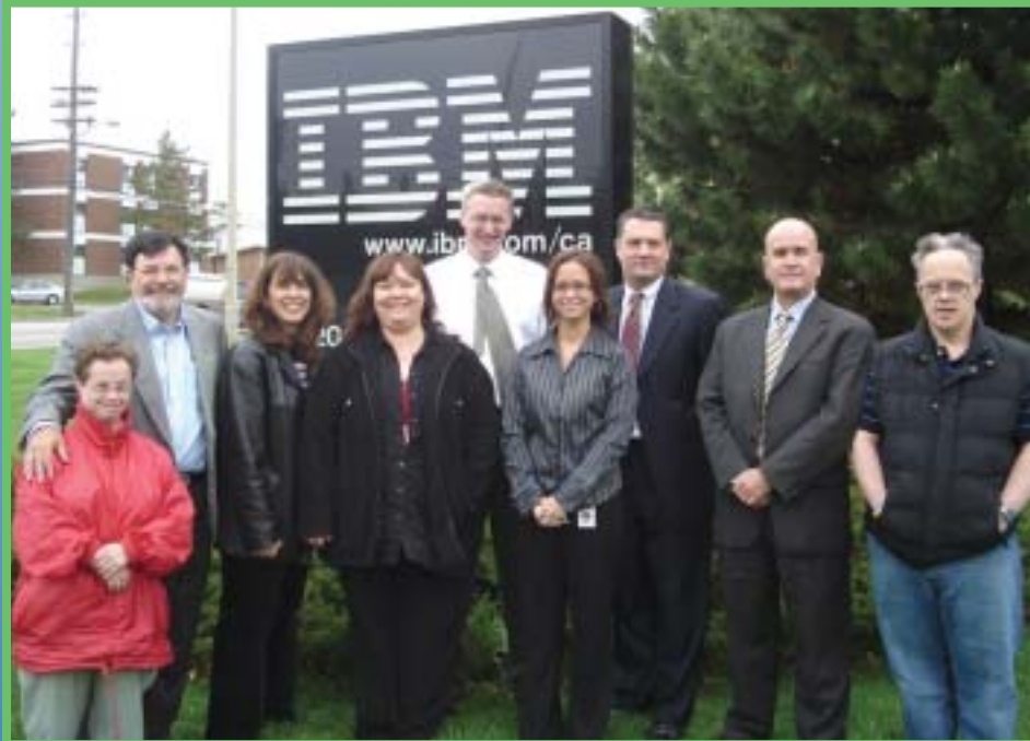
Representatives from the IBM Employees' Charitable Fund and Tamir come together.

this gap and provided funds, as part of their 50 th anniversary celebration, for much needed therapeutic services such as speech pathology, occupational therapy and nutritional counseling to individuals in need and unable to wait a year or two for subsidized supports.