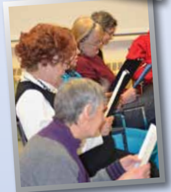
Members of the Tamir Neshama Choir