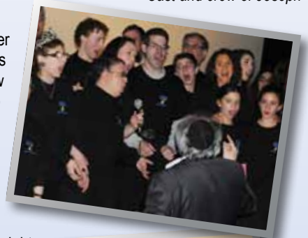
Cast and crew of Joseph

Hardly a month had gone by after the production before members of the community cast and crew of Joseph were called back to perform a double booking with the Tamir Neshama Choir in Montreal on June 6 th , 2010. Not only did they sing a medley of songs during the Israeli Street Festival earlier in the day, but later that night they entertained the crowd at the Cummings Jewish Centre for Seniors. The Tamir Neshama Choir continues to perform songs from the musical at events in Ottawa and elsewhere.