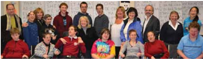
Members of the 2011 Bar and Bat Mitzvah Class

An exciting development for Tamir is the launching of a new Bar and Bat Mitzvah class. L'Dor Va-Dor, (from generation to generation) takes on a whole new meaning, as some of our past Bar/Bat Mitzvah candidates are acting as mentors and tutors for the next generation of participants, helping to teach prayers as well as pride of Jewish living. Everyone is looking forward to the upcoming Bar and Bat Mitzvah celebration on June 12 th , 2011.