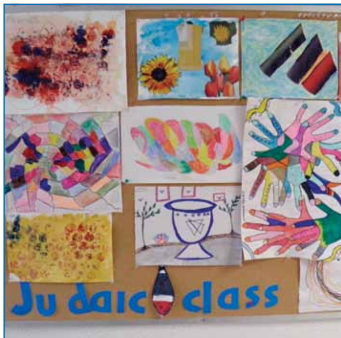
Judaic artwork on display

Celebrating the High Holidays at their local Synagogue, Community Shabbat Dinners, Family Sukkot celebration, Purim masquerades, and Passover Sedarim continue to be events our participants and their families look forward to each and every year. Through the power of their voices and infectious enthusiasm the Tamir Neshama Choir continues to be an integral part of the Jewish community and the general community as well. This year we have reached out to other agencies serving people with Developmental Disabilities and recruited 5 new choir members. They have been warmly greeted by our gang and our new members feel right at home and ready to "give back" to the community.