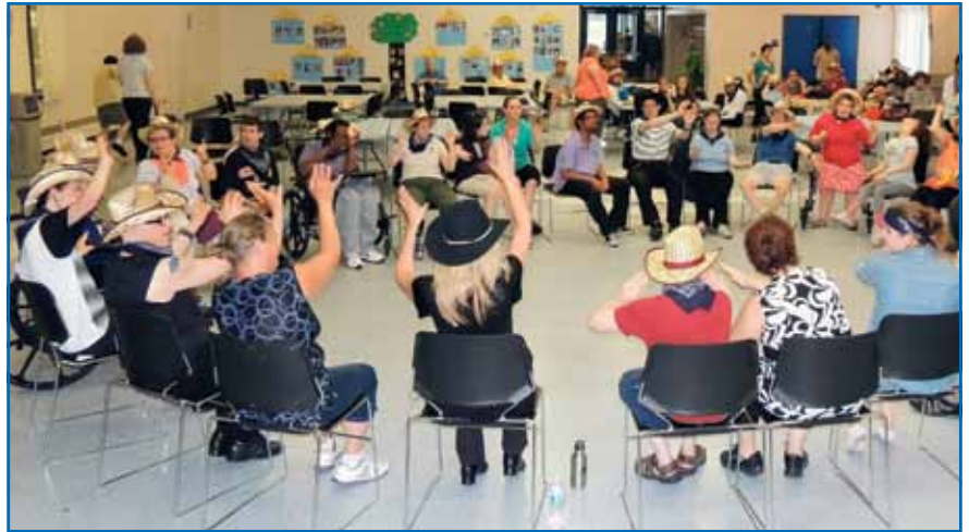
Participant appreciation circle